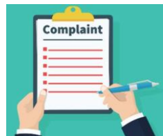
Complaint Report and Process