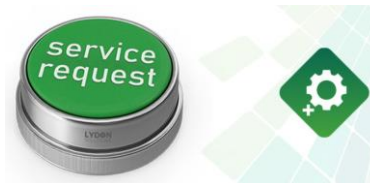
Business Acceptance New Connection, Card Lost etc.