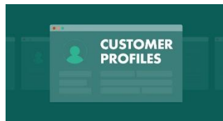
Customer Profile Inquiry, Change