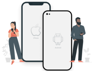
Self Service App